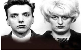
Ian Brady and Myra Hindley