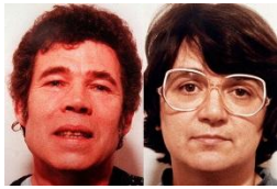
Fred and Rose West