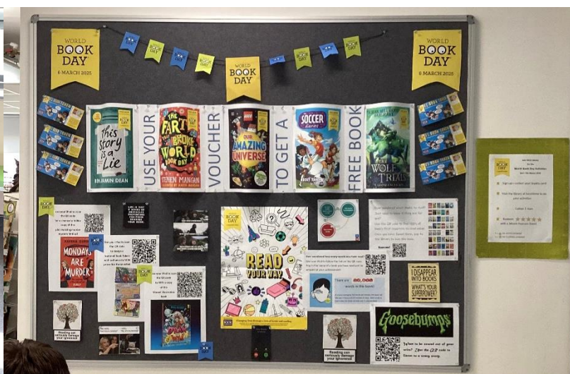
Reading hour (left) and the great display for WBD in the library (right)