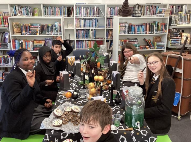
Harry Potter themed feast