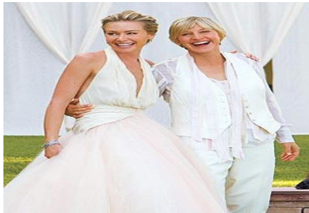
Ellen DeGeneres and Portia de Rossi