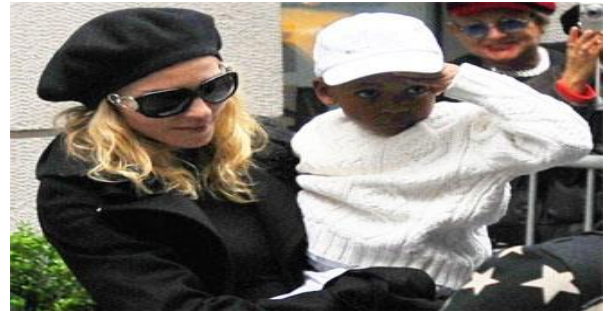
Madonna and adopted child