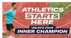
Coventry Schools Athletics Competitions