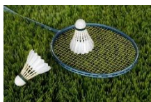
Badminton Club All years 7-11