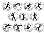
Athletics Club All years 7-10