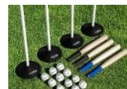
Rounders (All years 7-10)