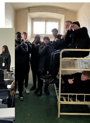
Shrewsbury Prison Trip