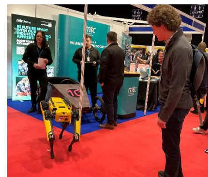
National Apprenticeship Show

This week all Year 12 students attended the National Apprenticeship Show to find out more about the process and speak to employers about opportunities open to them. It was a positive morning for the students who enjoyed being able to speak to experts in their field as well as coming home with lots of free goodies!